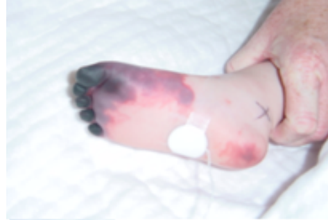
Figure 2: Blackened toes following septicaemia

If your child's fingers or toes are affected then the doctors may decide not to remove them surgically, but allow the blackened digits to fall off naturally (auto-amputate). This will ensure that as much healthy tissue is preserved as possible. This process can take some time, so it is possible these auto-amputations will happen when you are back at home.