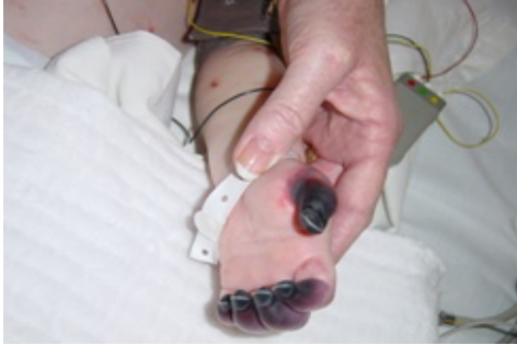
Figure 1: Blackened fingers following septicaemia

This means that they will amputate at the lowest possible level whilst making sure that there is sufficient healthy tissue to allow the residual limbs to heal as well as possible. A consultant in rehabilitation medicine (a doctor who manages the amputation rehabilitation) will ideally consult with the surgeon before the amputation operation to make sure that the level of amputation is suitable for the fitting of a prosthetic limb in the future.